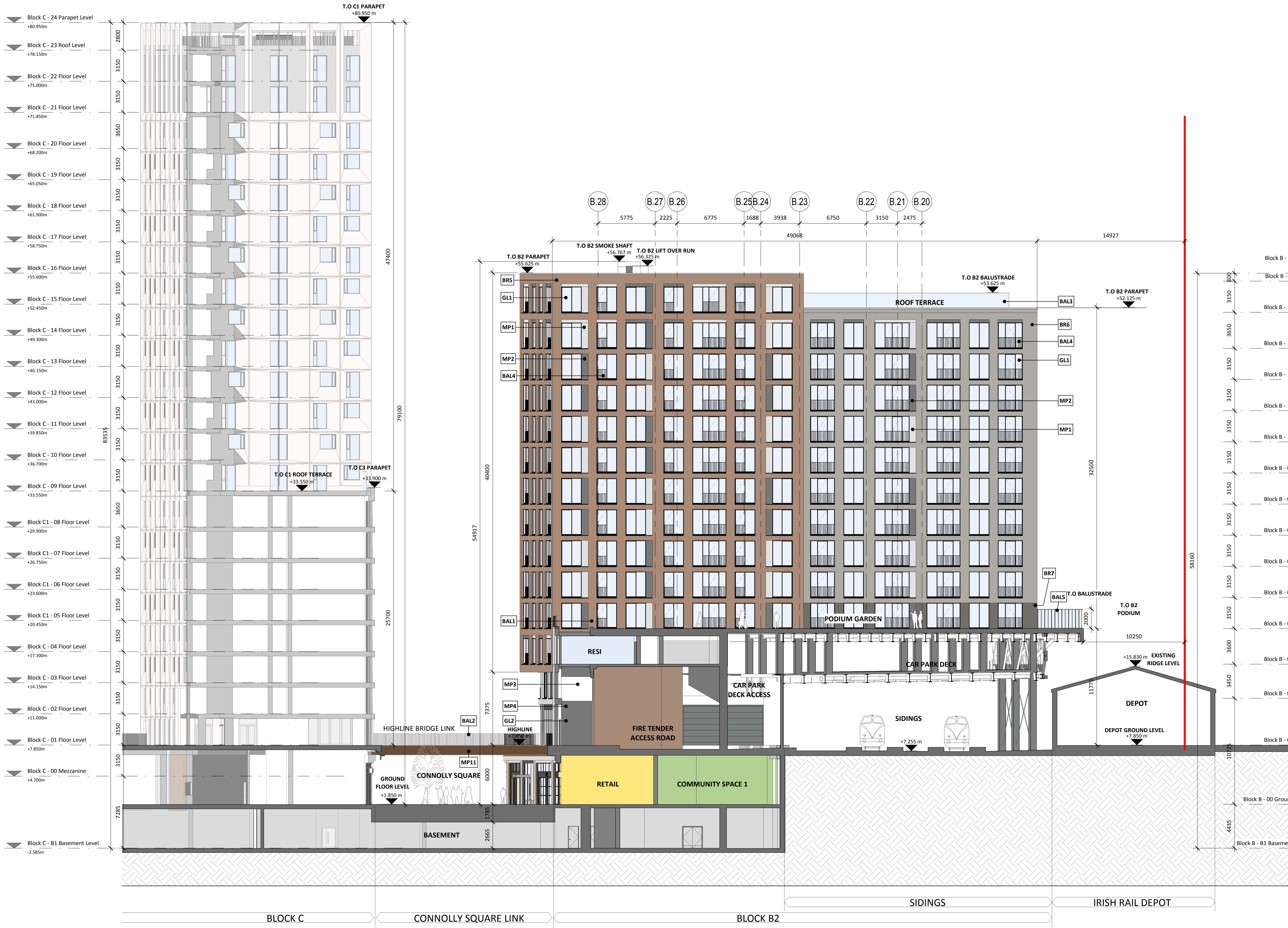
E-E BLOCK B - SECTION E-E 1 : 200